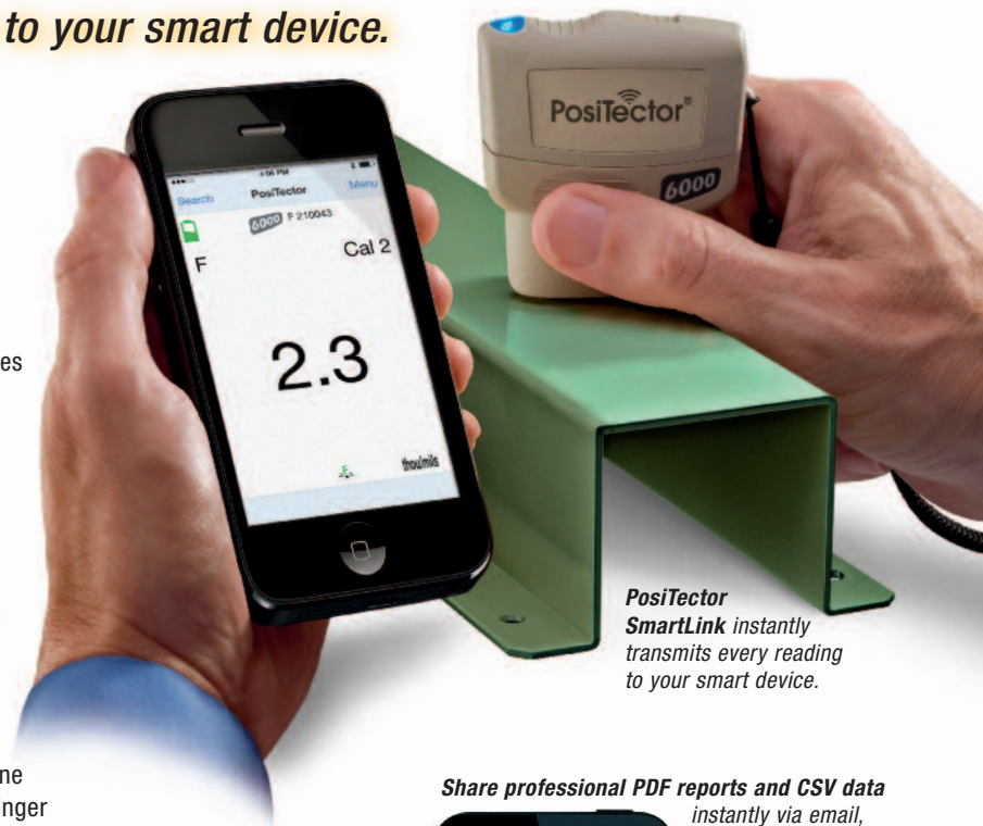
PosiTector SmartLink instantly transmits every reading to your smart device.

Share professional PDF reports and CSV data instantly via email, Dropbox, AirPrint™ or other applications on your device.