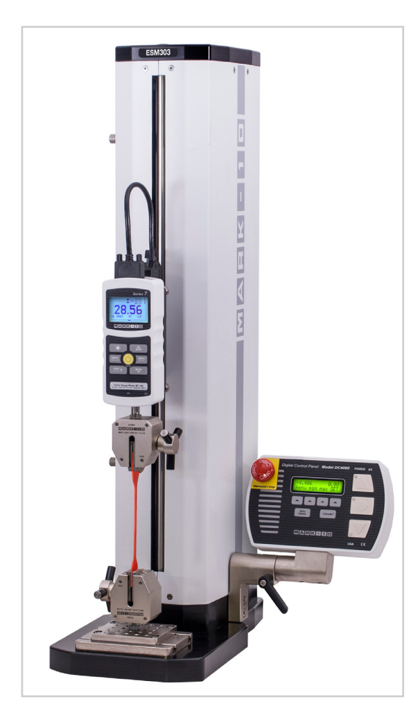
ESM303 is shown above configured for a tensile test, with a Series 7 force gauge and G1061-2 wedge grips.