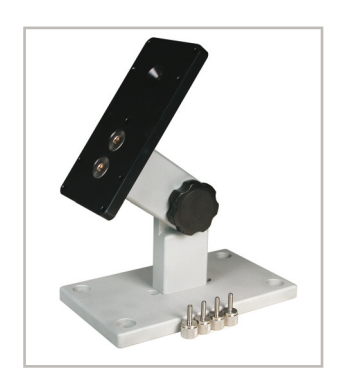
Optional AC1008 tabletop mounting stand