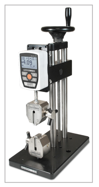
Shown with an ES20 test stand and G1061 wedge grips

Series 3 gauges include MESUR<sup>®</sup> Lite data acquisition software, for tabulation of continuous or individual data points. One-click export to Excel button easily allows for further data manipulation.