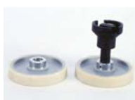
Heavy duty Contact Adaptors-