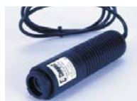
Remote Optical Sensor

rpm • Linear speed Metres & Feet per min (Metres/sec Metric Model) • Count mode - length & revs • Time interval (reciprical speed) • Time accumulative (average rate)